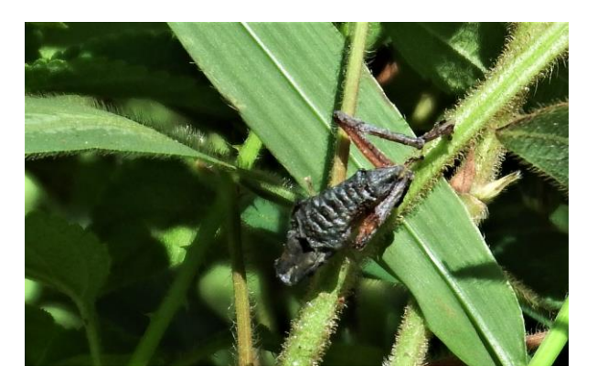
Above: A species of frog.