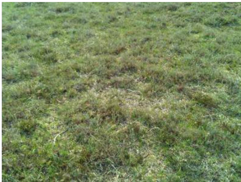
Figure 1: Pioneer heather was most abundant at this site with building heath also being frequent. The high abundance of grass has been very heavily grazed.