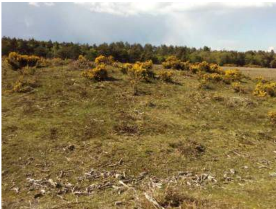
Figure 3: The shape of barrow was intact although trampled at the top, and horse and cattle faeces found on site.