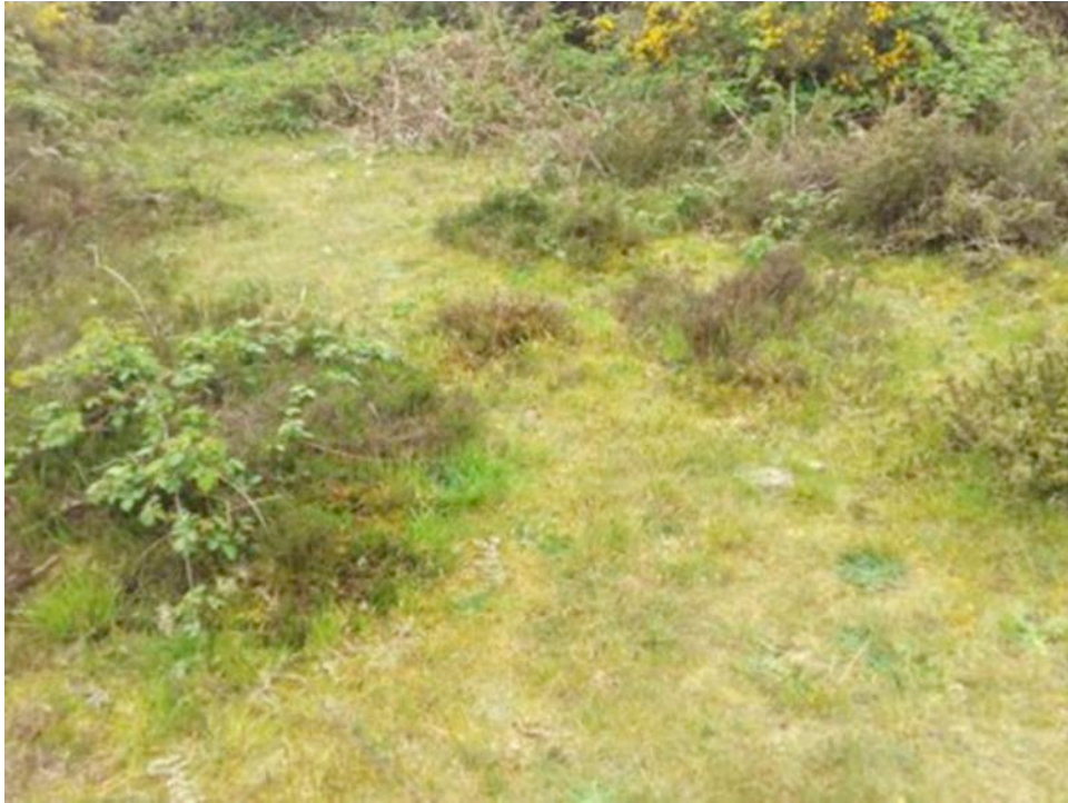
Figure 1: Cattle faeces, and dog and human footprints – evidence of trampling.