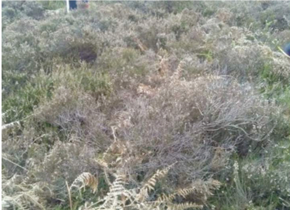
Figure 1: Heather was the most abundant at this site. The heather was building and pioneer heath.