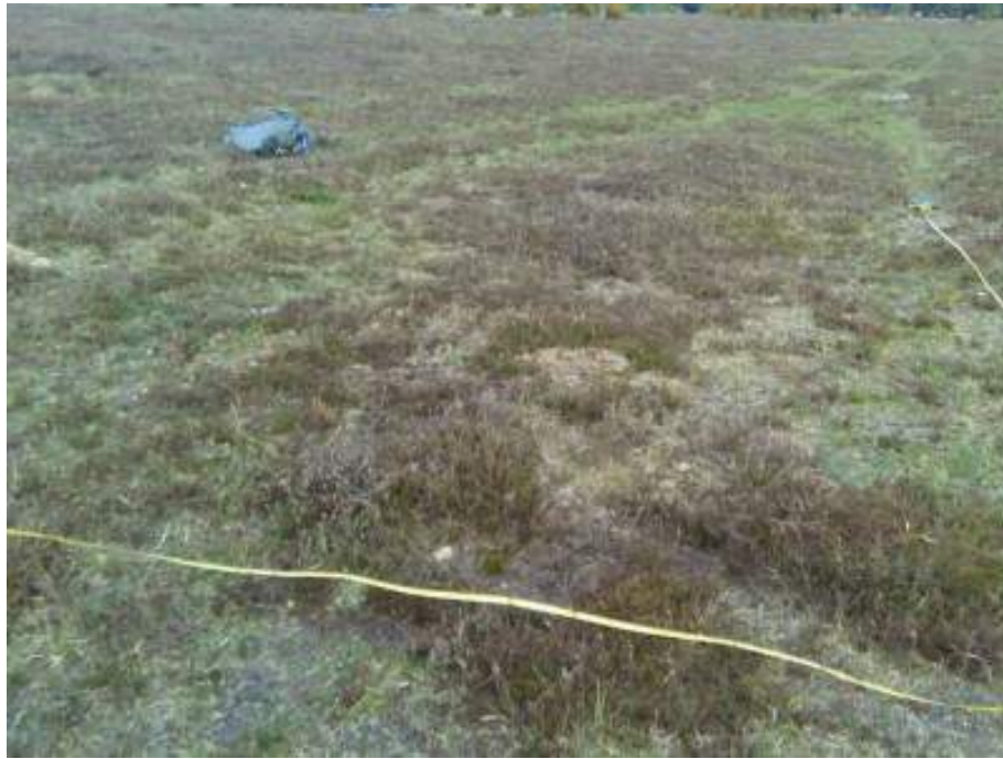
Figure 1: Heather was the most abundant at this site, the heather was mostly building heath. Evidence of trampling can be seen near the centre of the image where bare ground is present.