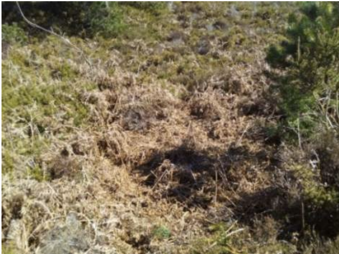
Figure 3: Evidence of trampling on the barrow with coniferous trees present.

prevent erosion of sediment on the barrow, by trapping it within its shallow route system.