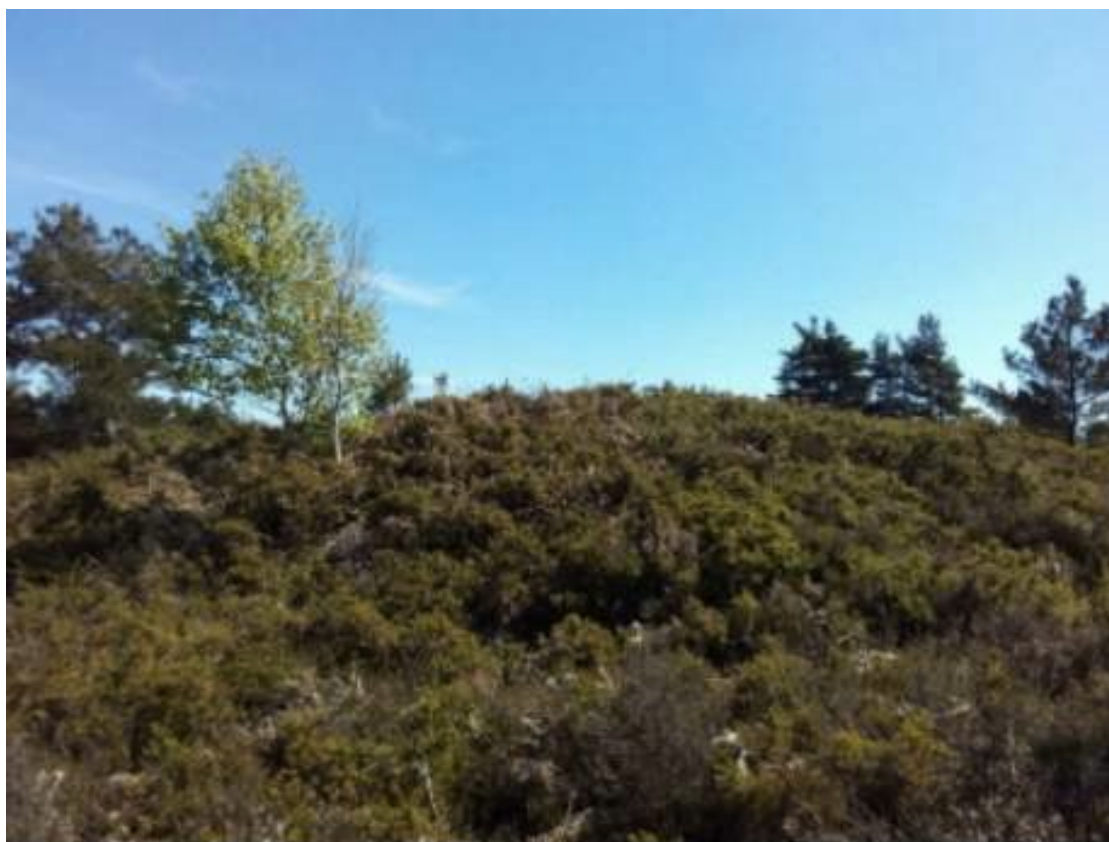
Figure 2: Bronze Age barrow at Canford heath.

Bronze Age burial mounds, barrows, can be seen on Canford Heath. These barrows are from the Bronze Age settlers that cleared the Oak and Bird woodland that covered South East Dorset 3,500 years ago. The heathland provided the local inhabitants with bedding, thatching materials, livestock grazing, and turf for fuel or a source for gravel, sand or clay. There are visible boundary lines from 19 th century enclosures. These enclosures were mostly planted up as pine plantations, Scots and Maritime pine trees are still present in the heathland. There are tracks through the heathland that have been used since the Saxon times. South Walk was an important route between Christchurch and Wimborne in the 1700s.