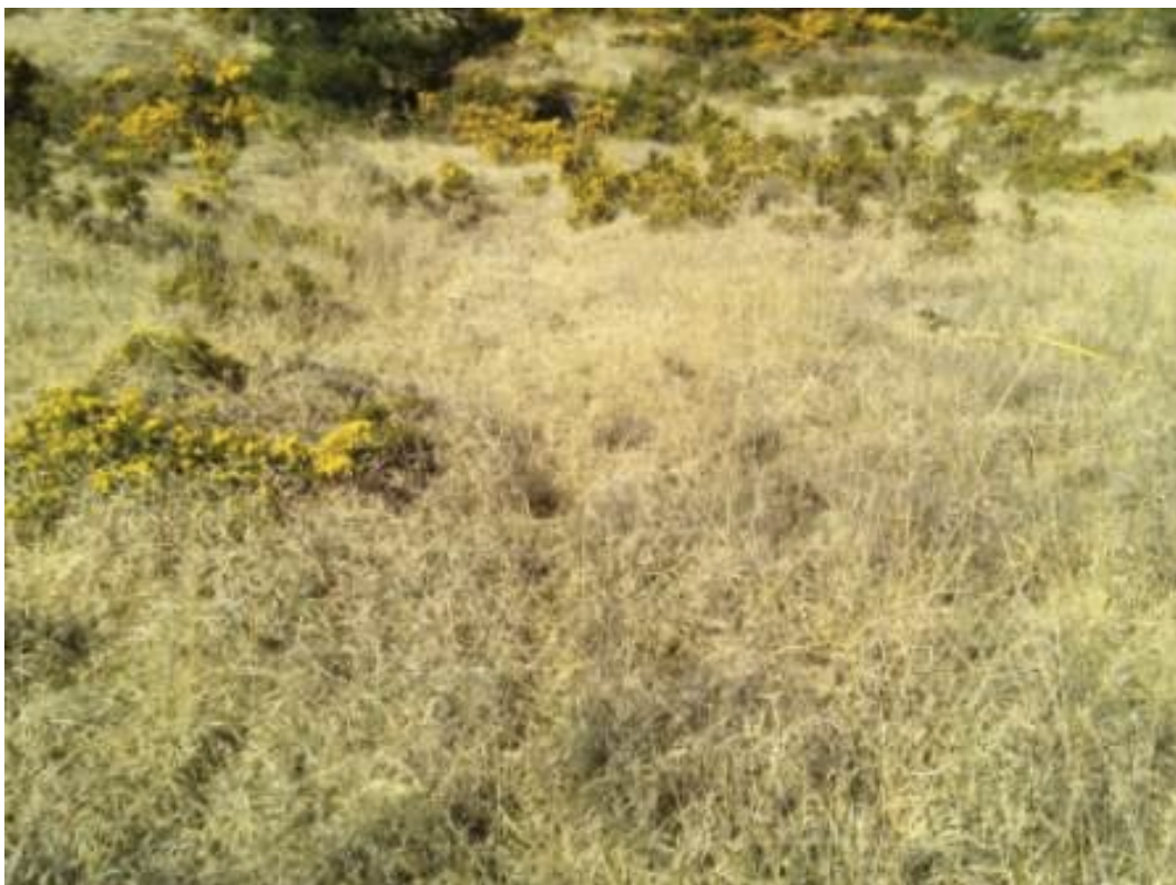
Figure 1: Ecological plot at Tadnoll heath showing the large amount of grass and heather.

When Tadnoll heath was examined it was found to consist of mainly mature heather, however heather at all phases of its lifecycle were found in fairly even ratios. When the vegetation's height was measured there was great variation, with the shortest height measuring at 3cm, the highest at 89cm, averaging in at 35cm. The even ratio of heather at different stages of its lifecycle reflects how well this heathland has been managed. Rotating the herbivorous livestock that graze on the heather ensures that the heath remains uneven, open, and varying in heather ages, which all helps to support vulnerable heathland species.