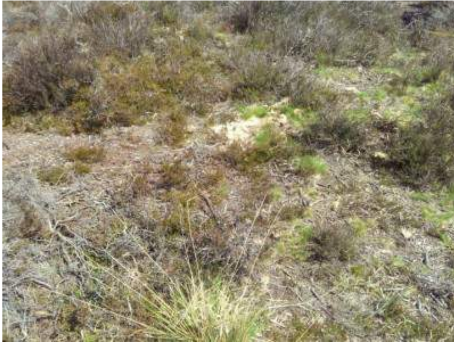
Figure 1: The majority of the heather was degenerate and dead patches were found occasionally. However there were also high amounts of pioneer heath growing around the degenerate patches. Grass was occasional and bare ground and tracks were plentiful as a result of trampling by deer and horses.