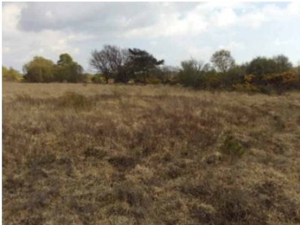
Figure 3: Bronze Age bowl barrow showing the high degree of erosion present.

Trampling has also contributed to the noticeable damage to the barrows, on average 18% of the barrows are covered by tracks. Trampling from humans, wild animals and domestic animals has contributed to the damage experienced on these three Bronze Age bowl barrows. Luckily, no tracks from vehicles or bicycles were found on these barrows, which would cause much more significant damage to these archaeological remains.