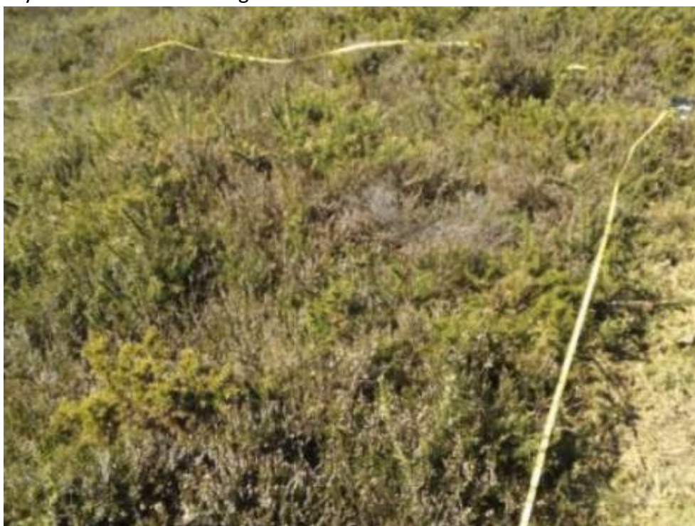
Figure 1: Heathland plot showing the vegetation composition of mainly heather

Canford heath contains a mix of wet and dry lowland heather. The heather itself was examined to be on average mostly mature and degenerate heath, however, heather at all stages of its lifecycle were found in fairly even ratios. When the heather was measured, there was large variation between the maximum and minimum heights, on average the shortest heather in each plot was 6cm and the maximum 91cm, averaging in at 38cm. This ratio of heather found in all parts of its lifecycle are testimony to the success of the heather management plan put in place for Canford heath, achieved through herbivore rotation and scheduled systematic heath burning.