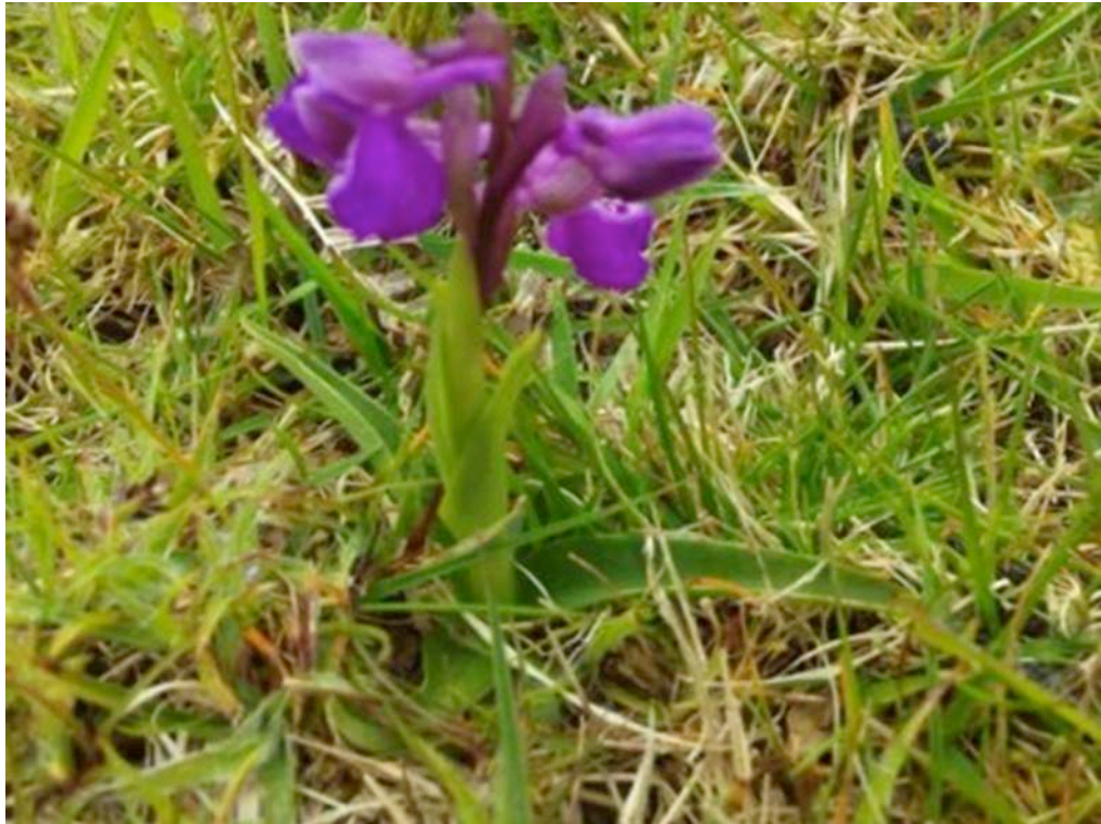
Figure 4: Orchids found near the barrow.

frequent grass and bramble. The bramble and nettles cause disturbance to the ground. Very degraded, barrow possibly disturbed by rabbits and dogs.