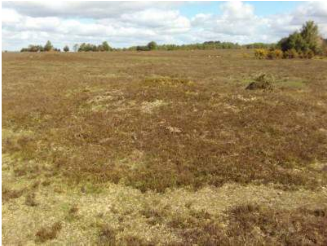
Figure 4: Bronze Age bowl barrow, heather was dominant at this site, with frequent grass, and occasional bracken.