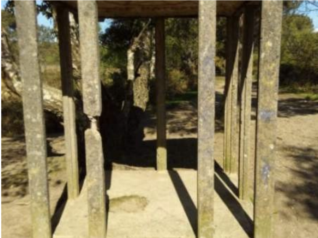
Figure 3: A concrete structure found at Upton heath.

There does not seem to be much damage caused by trampling to the features, only one structure (possible Bronze Age barrow) recorded any presence of tracks. These tracks resulted from people, wild animals and domesticated animals, as the barrow was in close proximity to a path (5 meters).