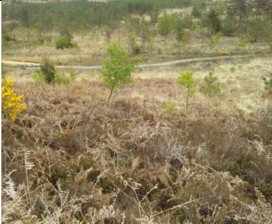
Figure 1: The majority of the heather was mature with frequent large patches of degenerate heather. Building heath was present growing in-between gaps in the degenerate heather.