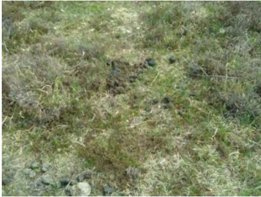
Figure 2: Evidence of livestock, from presence of faeces and grazed vegetation.

There wasn't much evidence of foot pressure at the site; there were the casual dog walkers and people going for a run, but not in large numbers.