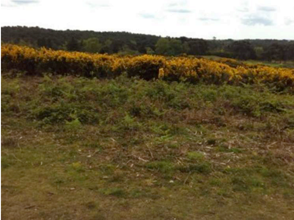
Figure 2: No heather was present, overtaken by bracken and bramble. Gorse was rare on the site, but can be seen in abundance in the background.