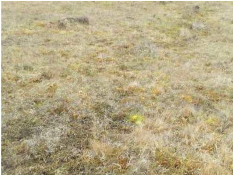
Figure 2: Moss was largely abundant on this heath, due to the site being located in bog.