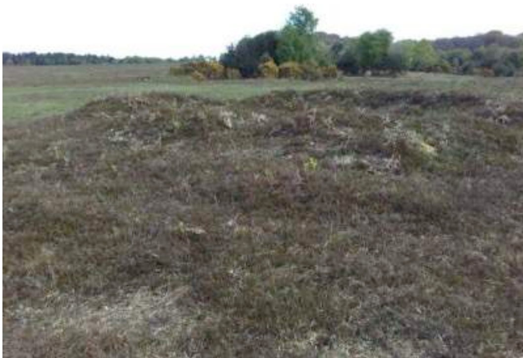
Figure 3: Noticeable damage to a Bronze Age barrow, heather was dominant at this site, with frequent bracken and grass. Tracks covered a large percentage of ground at 30%.

Humans and livestock walking over the barrows contributed to the presence of tracks and trampling, as a result of soil compaction which over time influenced the shape of the archaeological features. No damage from vehicles was present, however on one of the barrows bicycle tracks were found, and with a heavier mass, vehicles and bicycles increase earth compaction much more than pedestrians walking.