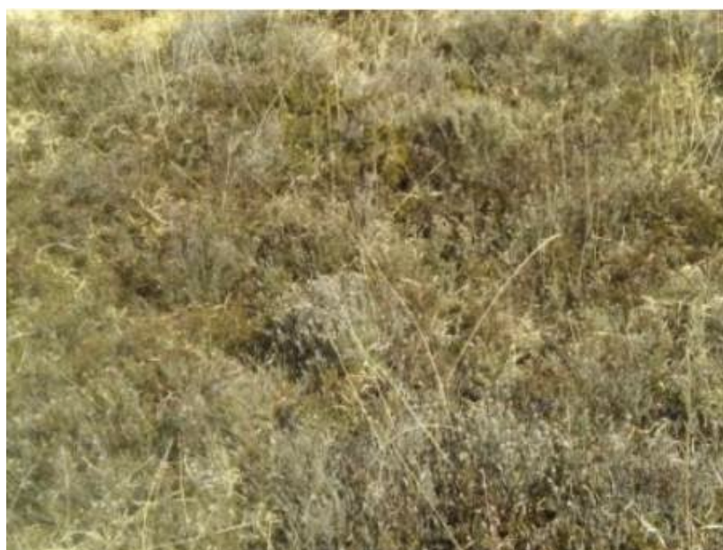
Figure 1: Ecological plot on Winfrith heath with building and pioneer heather dominant.

When the heather was examined, it was found to mostly consist of pioneer and building heath, but heather in all phases of its lifecycle were found. The height of the heather varied, on average the shortest measured 4cm and the tallest at 85cm, averaging in at 29cm. The low average height of the heather reflects the fact that it mostly consists of pioneer and building heath in the early stages of its lifecycle.