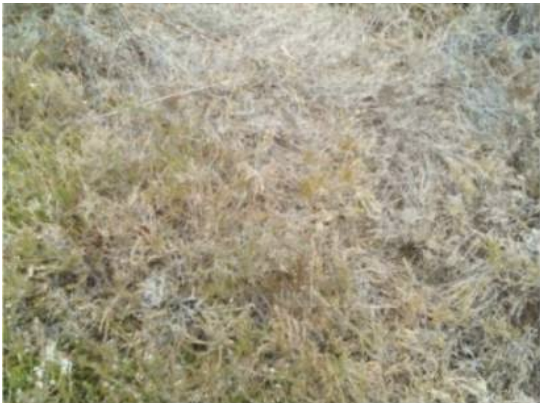
Figure 2: Evidence of tracks trampled by deer.

No seedlings, saplings or mature trees were found to have signs of browsing in any of the plots studied. Tracks from cattle, deer and dogs were found on the heathland. There was plenty of deer dung found on the heathland and one cowpat. Combining these signs of grazing gives an average herbivory score of 2.5. A herbivory score of 2.5 is relatively low compared to the other heathlands, reflecting the success of the grazing management scheme using deer on the heathland.