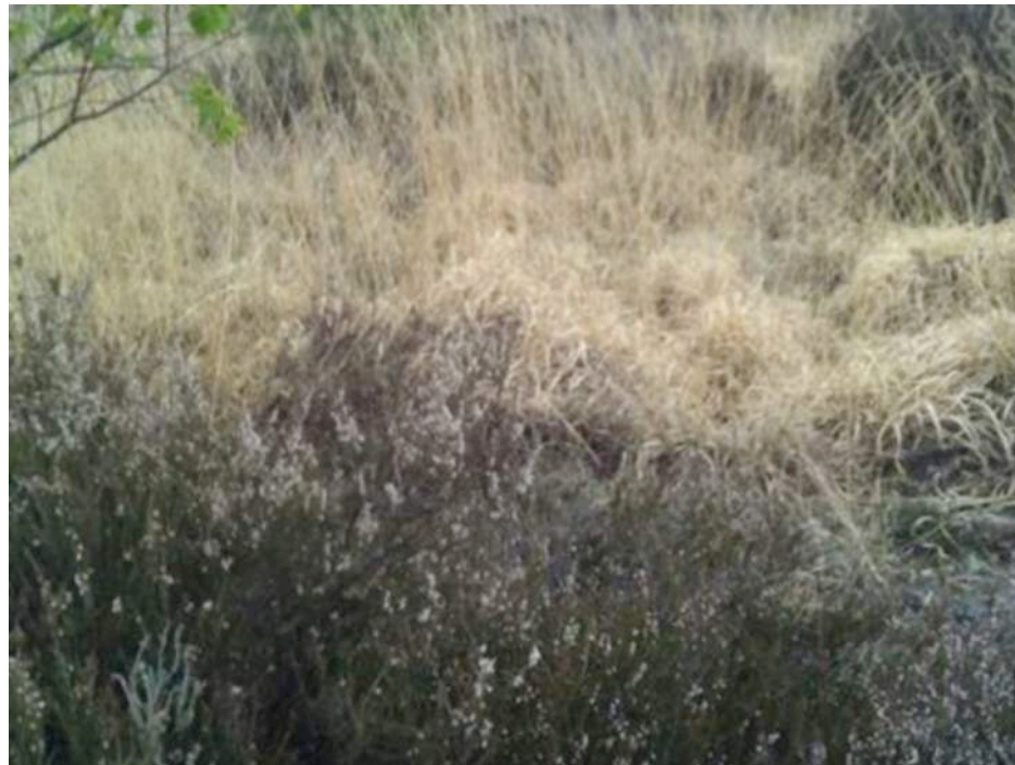
Figure 2: Grass was dominant. Heather was frequent. The majority of heather was building and mature heath. Degenerate and dead heath was frequent, and pioneer was rare.