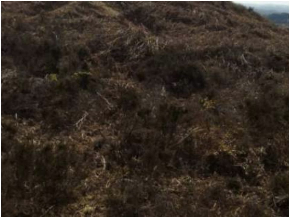
Figure 2: Bronze Age barrow with a large amount of bracken present.

Trampling has also contributed to the noticeable damage to the barrows, on average 18% of the barrows are covered by tracks. Trampling from humans, wild animals and domestic animals has contributed to the damage experienced on these three Bronze Age bowl barrows. Luckily, no tracks from vehicles or bicycles were found on these barrows, which would cause much more significant damage to these archaeological remains.