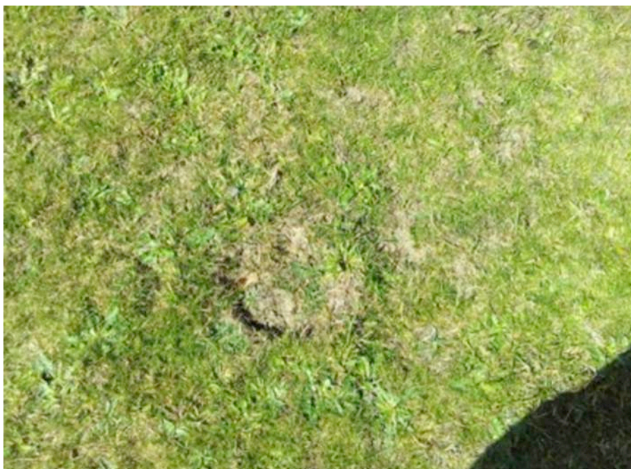
Figure 1: Heavily grazed heathland plot with a 5 on the Herbivory index. Horse faeces and hoof-prints were also found, which is evidence of trampling.

There was very little heather at Whitefield Heath. The only stage of heathland that was present was pioneer heath, which averaged a little less than 2 as a whole, which means that pioneer heath was occasional at Whitefield Heath based from the plots that were surveyed. Moss and bryophytes and lichen were only found in two plots. The corners averaged at 5 centimetres as the highest and at 3 centimetres as the lowest corner. The minimum height average was less than 1% and the maximum height average was 14%. Grass covered on average just under 92%. Heathers covered just fewer than 4% as an average and bracken and trees covered between 0-1% of all plots on average. Ground litter covered just fewer than 6% of all plots on average and tracks covered just fewer than 5% of all plots on average.