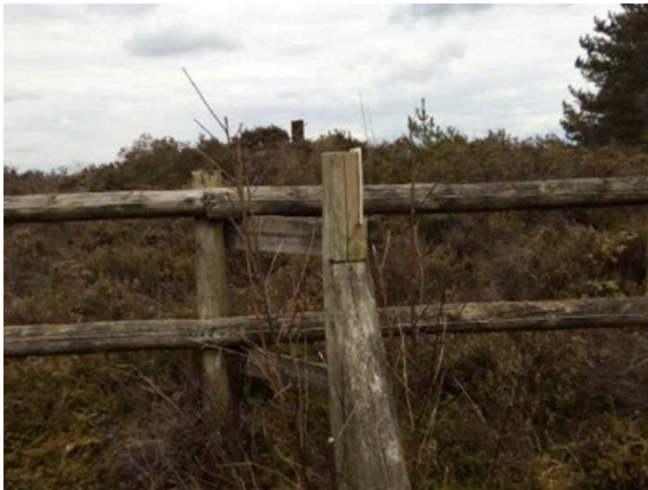
Figure 3: The area was fenced off in order to help preserve the monument. Barrow from the Bronze Age. Photograph shows the fence that helps to protect against livestock, but not people, who could climb over.

One bronze age barrow was found at Sopley Common, which had noticeable damage, and the damage covered 30% of the barrow. The highest part of the barrow was 800 centimeters and the minimum height of the barrow was 10 centimeters. The average height was 240 centimeters. Heather covered 8%, gorse 5%, bramble 5%, trees 5% and a 5 th of the barrow was ground litter. 14 coniferous and 7 deciduous trees of various sizes covered the barrow. No tracks from people or animals were on the barrow, which means that people and animals are not damaging it but vegetation is causing damage to some extent of the barrow due to it residing on it. The barrow is also one meter from the path which means that it is easily accessible which is good for tourism but not for the protection of the barrow.