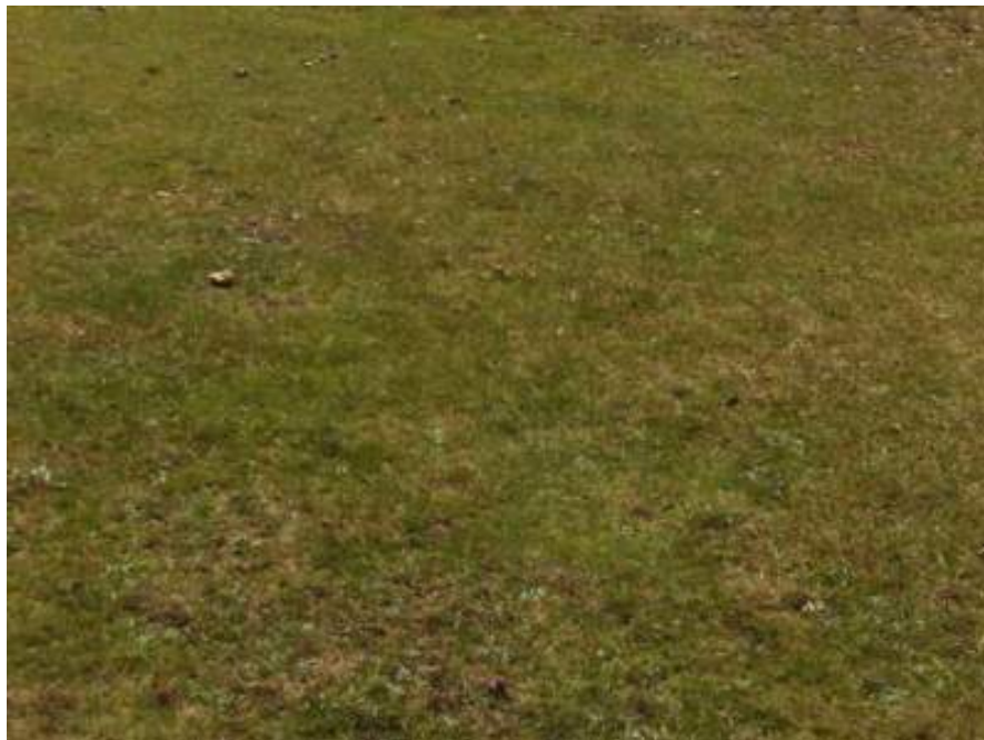
Figure 2: Livestock and people caused tracks and trampling.

A 5 th of the archeological feature found at Whitefield was noticeably damaged. The highest corner was 1200 centimeters and that being the maximum height and the lowest corner was 20 centimeters, with the minimum height being 5 centimeters. Grass covered 10%, heather covered 65%, gorse covered 25% and bramble covered 10%. It is a worry that gorse covers a 4 th of this archeological feature as its roots run deep and it is challenging to get rid of. Ground litter covered 10% and tracks covered 5% of the archeological feature, which is a clear sign of trampling damage, and shows that more work needs to be done by the site manager in order to protect the archeological feature. There were also tracks from people and domestic animals present and the archeological feature was 5 meters away from a path.