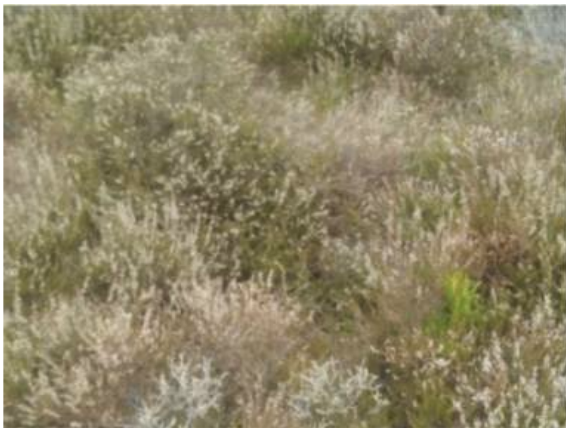
Figure 1: Mature heather is dominant in this plot, with frequent building heather present also.

Stoborough National Nature Reserve contains woodland, bog, acid grassland, wet and dry heathland, which supports a variety of specialist species, such as Dartford warblers, skylarks and nightjars. The most common age of heather in Stoborough heath was mature heather, followed closely behind with building heather. However, heather in all stages of its lifecycle were found. When the heather was measured, on average the shortest measured 3cm, the tallest 102cm, but on average the heather measured 33cm, this highlights the dominance of mature heather present in Stoborough heath.