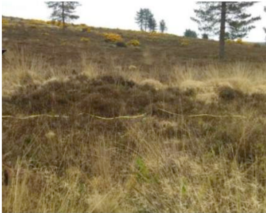
Figure 2: This photos shows that grass is dominant on this heathland, building heath is also abundant.