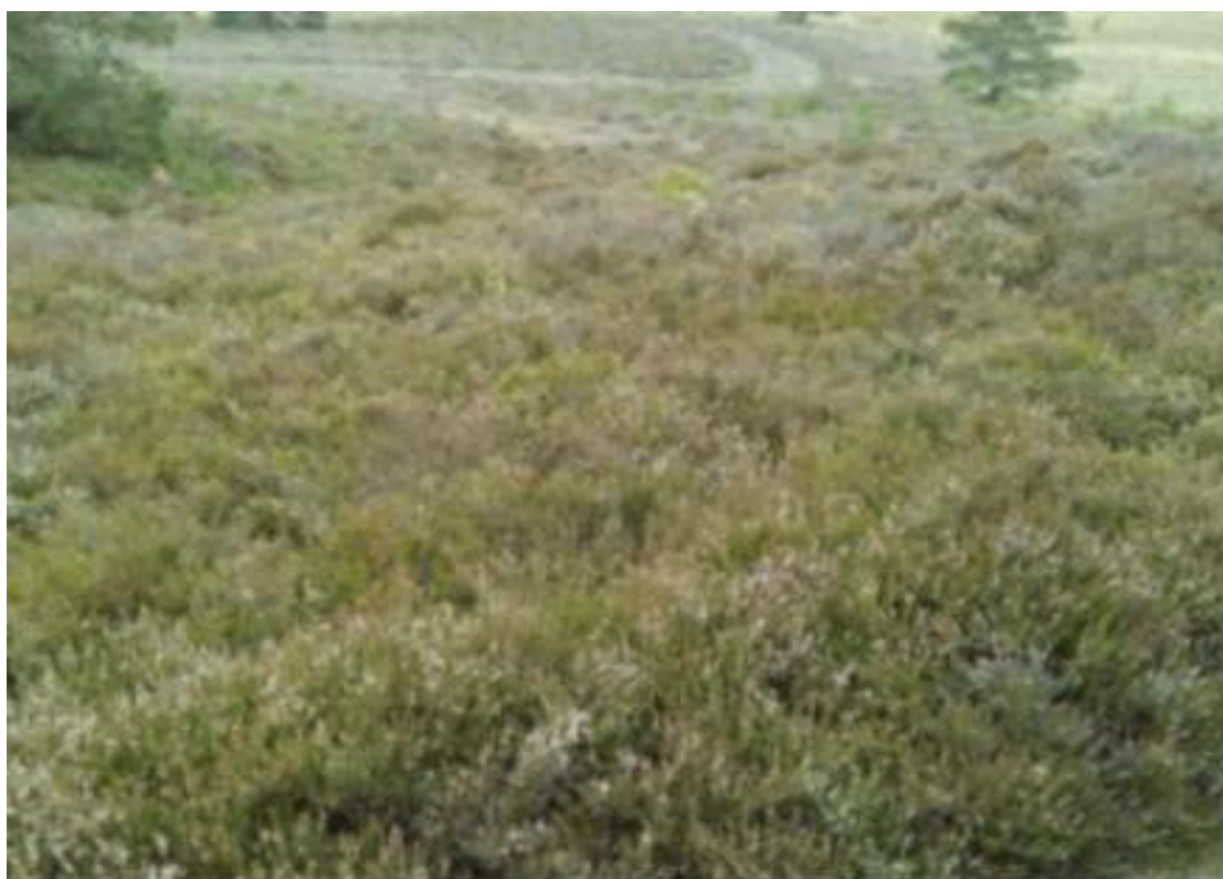
Figure 1: Building heather is dominant

The majority of the heathland at Arne is lowland heath, containing the rare Dorset heath ( Erica ciliaris ). The heather was examined to be mainly building heath (shown in figure 1), however heather in all phases of its lifecycle were found in relatively even ratios. When the heather was measured on average the minimum height was 4cm, the maximum height was 67cm and the average height was 28cm. This ratio of heather at different ages is testimony to the well-managed grazing program in place in Arne, achieved through sika deer rotation and scheduled systematic heather burning.