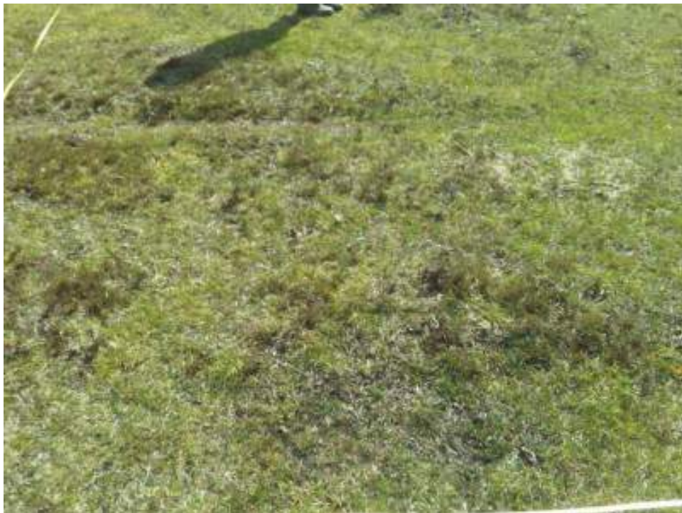
Figure 2: Grass was dominant at this site, the photograph shows that the area was heavily grazed with 5 on the herbivory index.

As part of the heath management plan, livestock such as cattle and horses and ponies are used as management tools. They are permitted to graze freely throughout the heath.