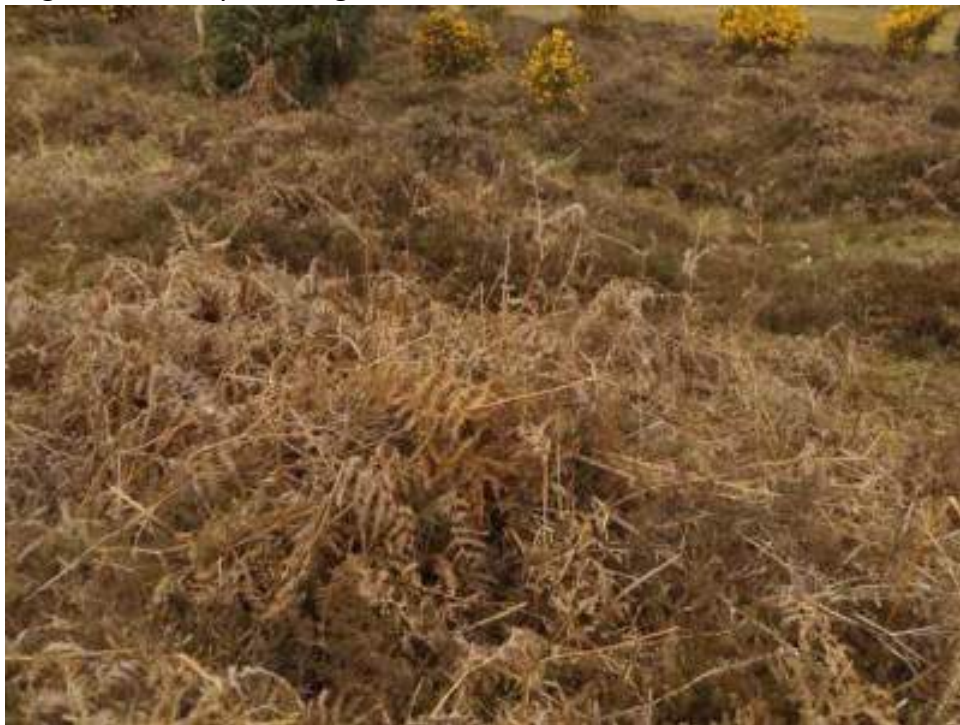
Figure 4: Incidental earthwork and ditch, this photograph shows the abundance of bracken at this site. A high amount of deciduous seedlings were found at this site, as it is starting to progress into woodland, which will increase the damage to the archaeological remains.