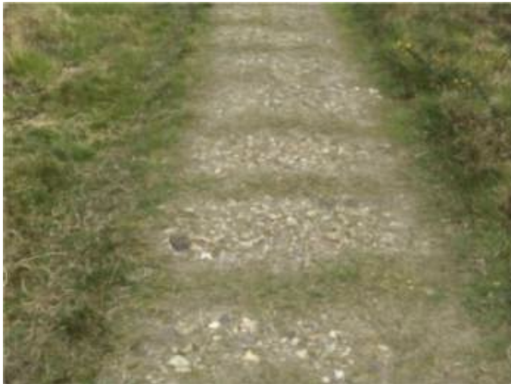
Figure 3: tramway track remains from the northwest.

Trampling has contributed significantly to the damage this earthwork has experienced. Tracks from people, animals, vehicles and bicycles were found on this archaeological feature. Vehicles cause the most damage to archaeological remains, as their mass is heavier, resulting in larger compressional and erosional forces to the tramway.