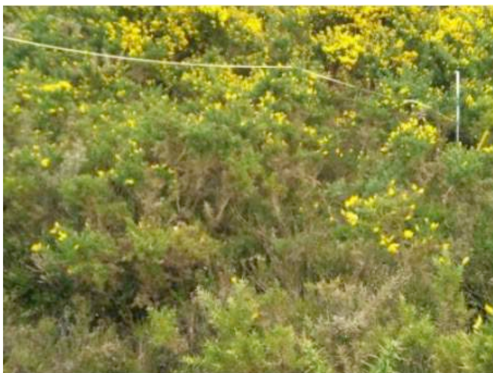
Figure 1: This photo shows the high amount of gorse growing; this has contributed to the herbivory index being low at this site, as most livestock and wildlife do not eat gorse.

Grass has an average percentage cover of 30%, heath has an average percentage cover of 50%, gorse has an average percentage cover of 19%, 4% average cover percentage of bracken, 0.8% bramble, 7.6% ground litter and 11% tracks.