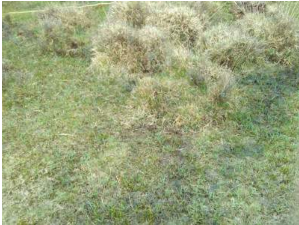
Figure 1: This image shows the abundance of grass at the site, it was moderately grazed, this can be seen in the short length on much of the grass.

Maintaining the heathland is also essential for maintaining the local archaeology found throughout these sites, and preventing further degradation. For example trees are very damaging to archaeological remains, which without appropriate management such as using livestock to graze seedlings, the heath would progress into woodland increasing damage to the archaeological monuments. Successful management of the heath ensures that the percentages of heather are also abundant, which also benefits the archaeology as the root systems of the heather are shallow, and bind the earth together reducing erosion.