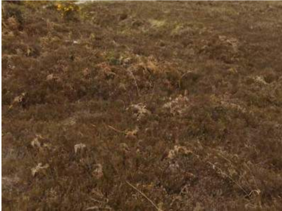
Figure 5: On this incidental monument, tracks covered quite a large percentage of ground (25%), which were caused by humans and livestock.