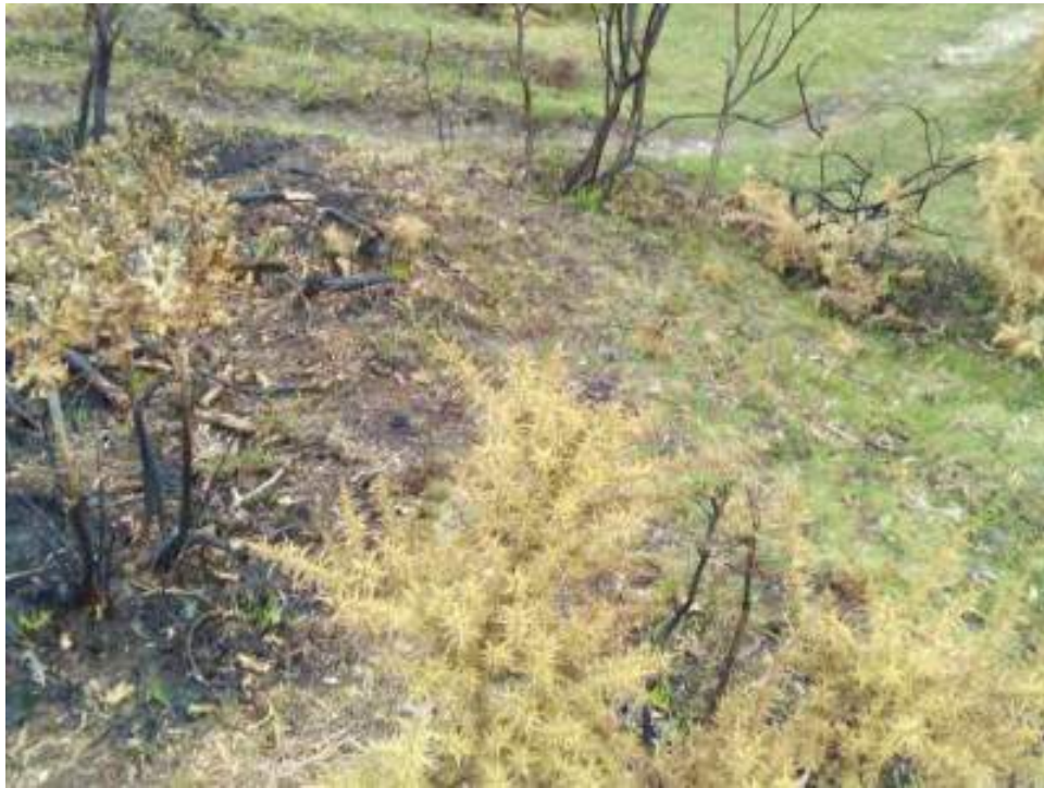
Figure 3: Incidental earthwork from the Modern Age. There was noticeable damage to the feature, the conditions of archaeological remains degraded by 20%. A nearby path can be seen, making it more likely that dogs would walk across the site.

tracks 27%. Tracks were found around and across the earthworks, created by humans, dogs, and livestock. This would have contributed to soil compaction, resulting in changes to the terrain and affecting the archaeology. No damage from vehicles was present.