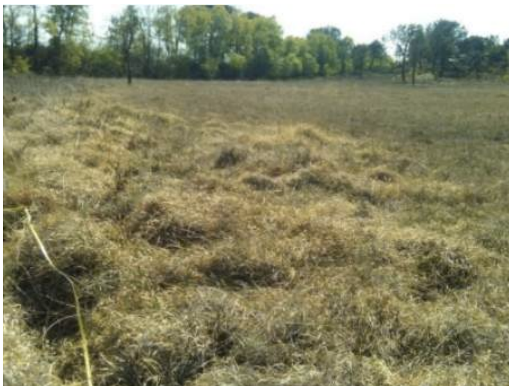
Figure 1: Heathland plot on Upton heath showing the dominance of grassland.

The heather itself was examined to be on average mostly degenerate and mature heath, although heather in all phases of its lifecycle were found in abundance. When we measured the heights of the heather there was great variation in heights, on average the shortest heather height in each plot measured 8cm and the maximum measured 96cm, on average the heather measured 38cm. The presence of heather in all stages of its lifecycle is due to the management technique used in this heathland, cattle and other herbivorous animals rotationally graze the heather to maintain an uneven and open landscape in which vulnerable wildlife to thrive.