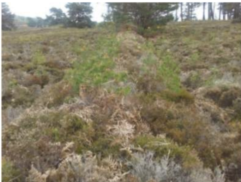
Figure 3: Potential field boundary in Arne.

Arne has the largest amount of scheduled ancient monuments than any other RSPB reserve. Humans have used the heathland of Arne for 4,000 years. Arne nature reserve preserves an important collect of barrows, however all of these barrows have been raided by 'gentlemen diggers' in the 19 th century. Arne Hill contains the remains of a heavy anti-aircraft position, which defended the cordite works in nearby Holton Heath. Due to the sparsely-populated nature of the heathland, Arne was used a night-time 'starfish' bombing decoy. Fires were lit to give the impression that the cordite works had been hit, drawing in waves of Luftwaffe bombers to the open countryside instead of more highly-populated areas, saving many lives. There are many bomb craters that can still be seen today and are now used as wildlife ponds, home to dragonflies, raft spiders and grass snakes.