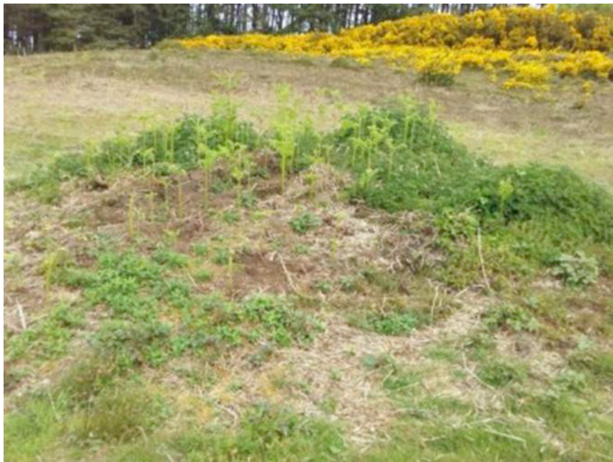
Figure 3: The Bronze Age barrow had been degraded by 70%. Bracken was abundant, with

There was one barrow surveyed at Matchams House Slope. The barrow is bronze age with a high level of damage, which is at 70%. The corners were 42cm, 14cm, 7cm and 44cm with the maximum height being 74cm and the minimum height being 1cm. The average height is 24cm. Only grass, bracken and bramble covered the barrow, with grass being 20%, bracken being 40% and gorse being 10%. No trees resided on the barrow and ground litter covered half of the barrow. Tracks from people, wild animals and domestic animals were present and no tracks from vehicles or bikes were present. Based from the extent of the damage of the barrow and the noticeable footprints from animals, more management needs to be done to control people and animals from going onto the barrow which will in turn prevent further damage and that's even considering that the barrow is 8 meters from the track.