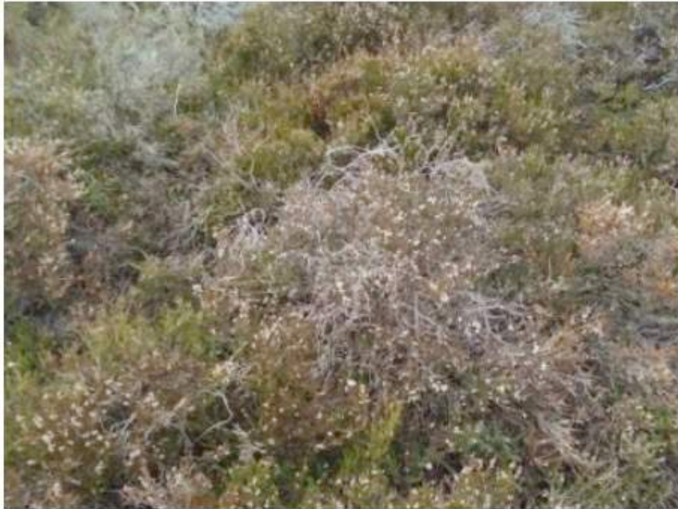
Figure 2: The heather in this photo is most degenerate with mature heather surrounding it. This could also influence the low herbivory index as heather that reaches degenerate or mature life stage is less likely to be browsed by wildlife and livestock, livestock would normally browse heather at earlier life stages.