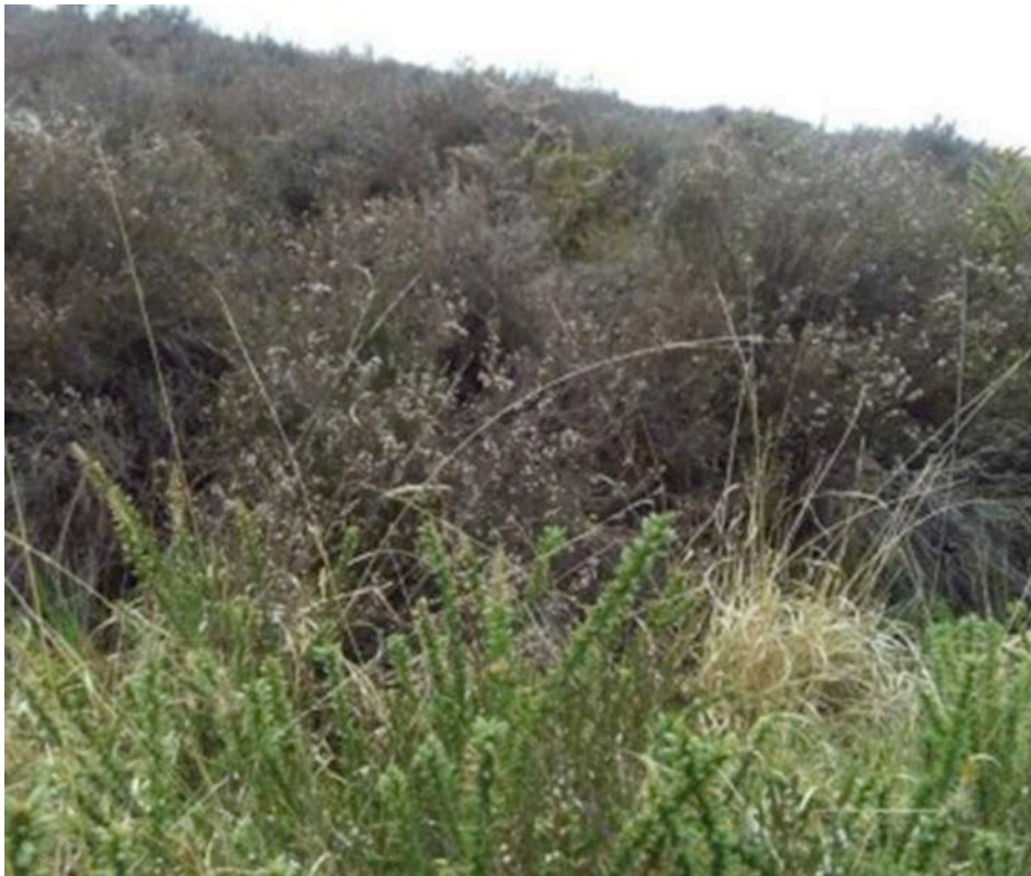
Figure 2: A variety of heather species were abundant. However the majority of this was degenerate heather. Pioneer and building heath was present growing in gaps in the degenerate heather, and frequent amounts of grasses and gorse were also heavily present particularly near the path.