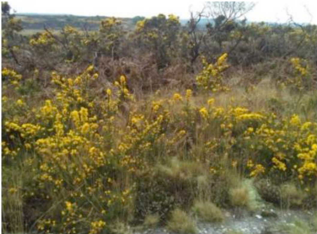
Figure 1: This photo shows that some areas are dominated by gorse and are of different life stages, but degenerate heath and building heath are also present.

The average percentage of grass cover is 20.3%, heather average percentage cover is 69.8%, gorse has an average percentage cover of 13.4%, bracken has an average cover percentage of 2%, bramble has 1% average percentage cover, trees have a percentage average cover 0.06%, ground litter has an average percentage cover of 8.6% and tracks have an average percentage cover of 7.4%. The average are based on 15 transects that were done at the site.