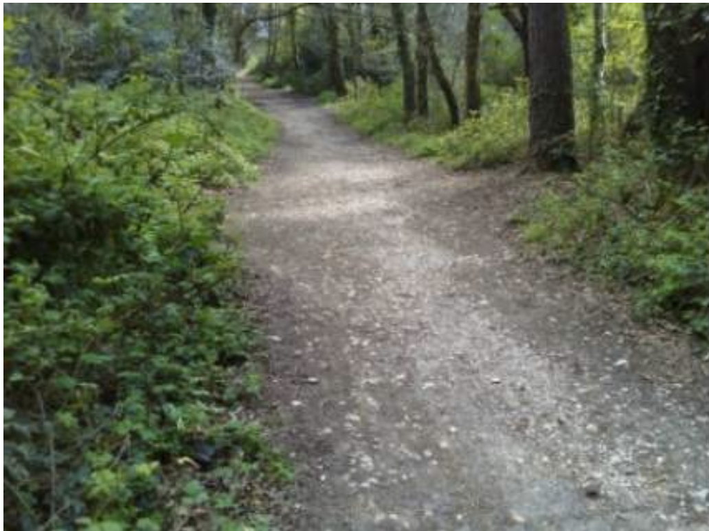
Figure 2: Roman road at Upton heath.

There are three archeological features that were studied in Upton heath, all three were incidental studies, consisting of a possible Bronze Age barrow, a Roman road and a modern concrete structure.