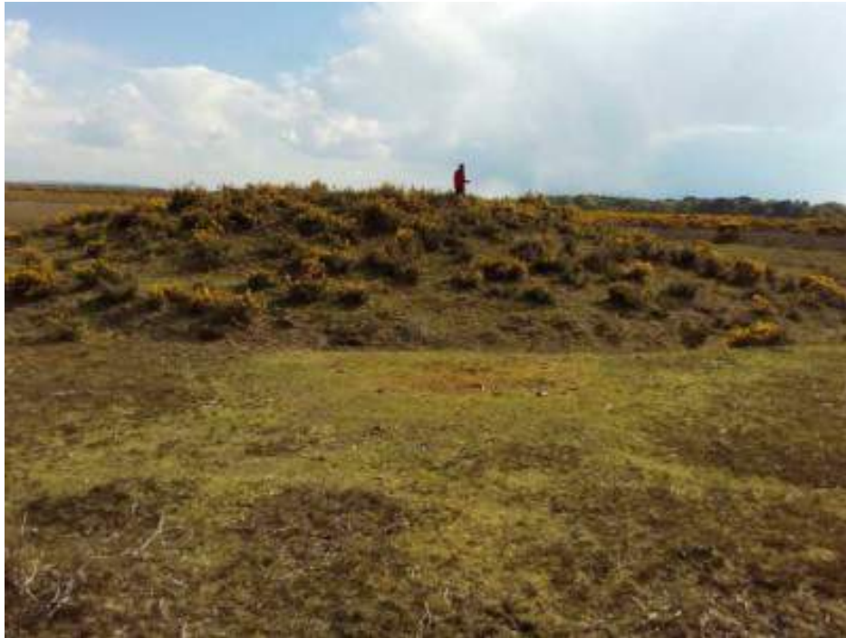
Figure 2: Bronze Age barrow, the shape of the barrow remained intact, although it was heavily trampled.