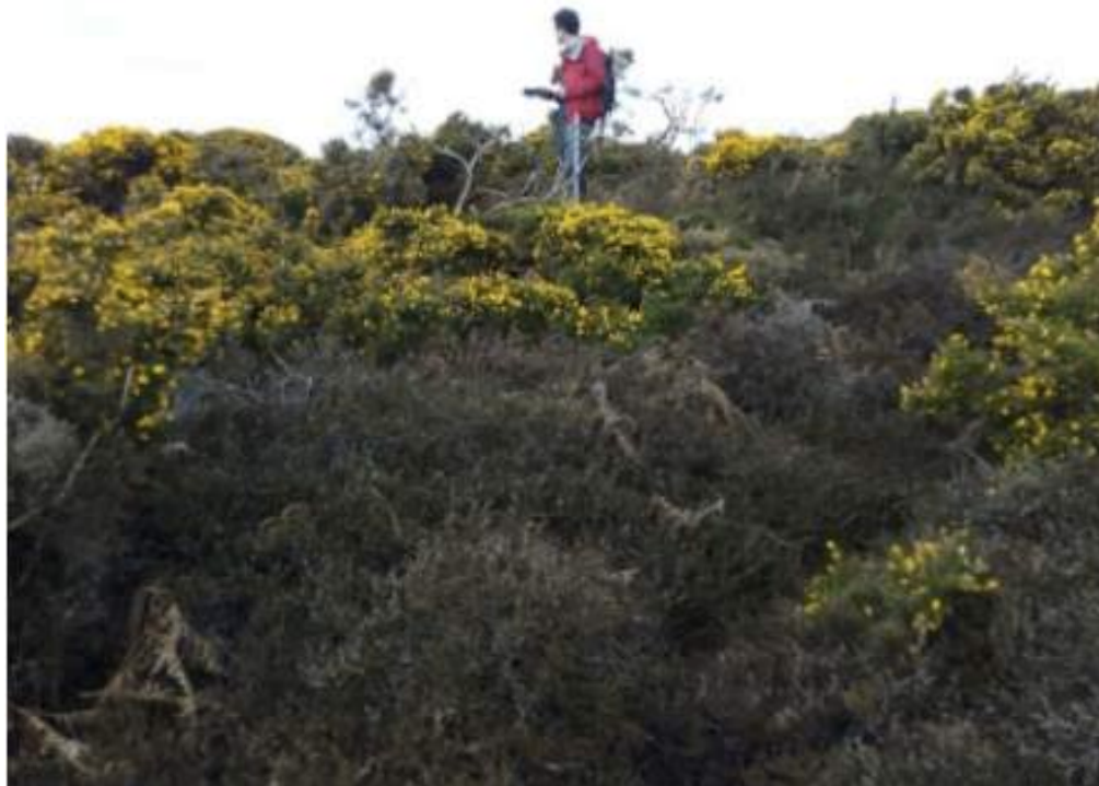
Figure 3: Large amount of heather and gorse present on a Winfrith barrow.

In the study, five archaeological barrows were investigated, one of which was an incidental study and the rest scheduled. All five barrows originate from the Bronze Age period, two of which being bowl barrows and the other three being traditional barrows. All five of these Bronze Age barrows have experienced noticeable damage, on average being 73% damaged. The Bronze Age barrows are largely covered by vegetation, mostly by heather and gorse. The barrows are covered 50% by heather, 42% by gorse, 9% by grass, 4% by bracken, 4% by ground litter, 0.2% by bramble and 0.2% by trees. On the five barrows studied, only three trees were found, one deciduous and 2 coniferous. The very small number of trees is promising on an archaeological conservation front, as tree roots can be particularly damaging to archaeology, because they can break up the ground and separate the features themselves. The large proportion of heather growing on these Bronze Age barrows can be beneficial for the features themselves, as the root system of heather is shallow, allowing sediment to become trapped and secured, preventing erosion of the barrows.