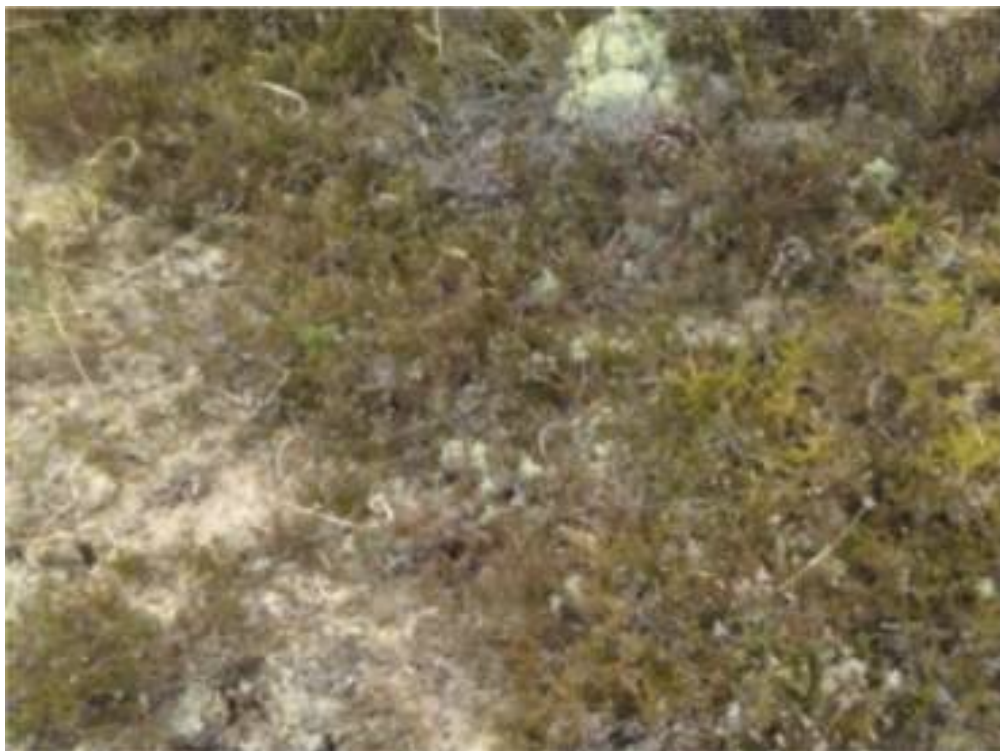
Figure 2: Stoborough heather with mild grazing, horse faeces, and tracks worn down from trampling.

When the heathland was investigated only 1 browsed sapling and 1 browsed mature tree was found in the fifteen plots investigated. Faeces from cattle, horses, deer and rabbits were found on the heathland, evidence of the heathland management scheme that is in place on Stoborough heath. Tracks were found in abundance from cattle, horses, deer and dogs, indicating the regular presence of these animals amongst the heath. When combining these factors, an average herbivory score of 2.3 was awarded. A herbivory score of 2.3 is relatively low, evidence that the grazing management scheme on Stoborough heath has been well managed, maintaining open and uneven heathland, whilst not becoming over-grazed.