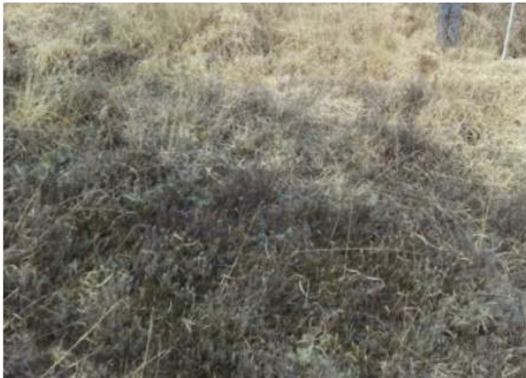
Figure 2: High frequency of grass within the heathland.

bramble and 0.6% trees. This ratio reflects how well managed this heathland is, maintaining a healthy ratio of vegetation that supports many rare species that depend on this environment.